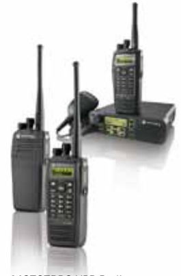
MOTOTRBO XPR Radios

“Spectrum is becoming a rare commodity. Therefore, you must be more efficient with what you have. With MOTOTRBO, we were able to create a large-scale communications environment that was very efficient with radio spectrum, delivered high audio quality and kept the cost at a reasonable level, considering the number of users on the system.”